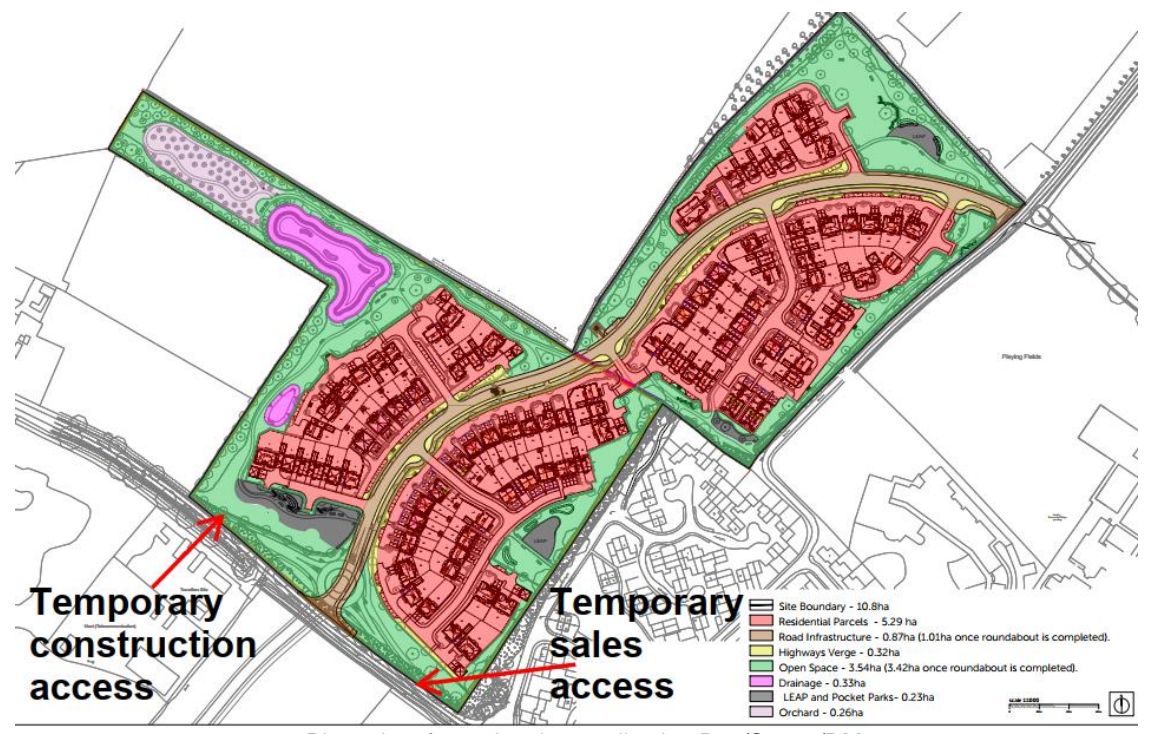
Plan taken from planning application P23/S0431/RM

1.9 The applicant provided additional information during the application process to address issues raised by consultees. The only application plan is a technical drawing showing the details of the temporary assess and this is <u>attached</u> as Appendix B.